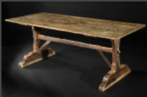
A 6-8 seater, 19th century, pine trestle table, 6ft 5in long