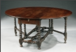
A rare, large, 8-10 seater, late-17th century, gateleg table, extending to 5ft 8in with an elaborate, turned, oak base and mahogany top, possibly Colonial