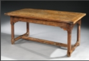
A 6-8 seater, late-18th century, 'H' stretchered, oak, farmhouse table, 5ft 2in long