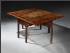
A large, 8-10 seater, mid-18th century, rectangular, oak gateleg table with an exceptional patina, extending to 5ft 3in