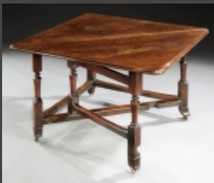
A rare, 4-seater, late-17th/early-18th century, walnut, envelope, gaming, or supper, gateleg table extending to 4ft 5 in.