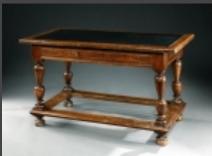
A 4-6 seater, Second Renaissance, French, walnut, centre table with a slate inset top, 4ft 10in long

Finally, I will be exhibiting from STAND 16 at the London Art Fair, Business Design Centre, Islington, 16th - 20th January 2013. Please email me if you would like a complimentary invitation to the fair.